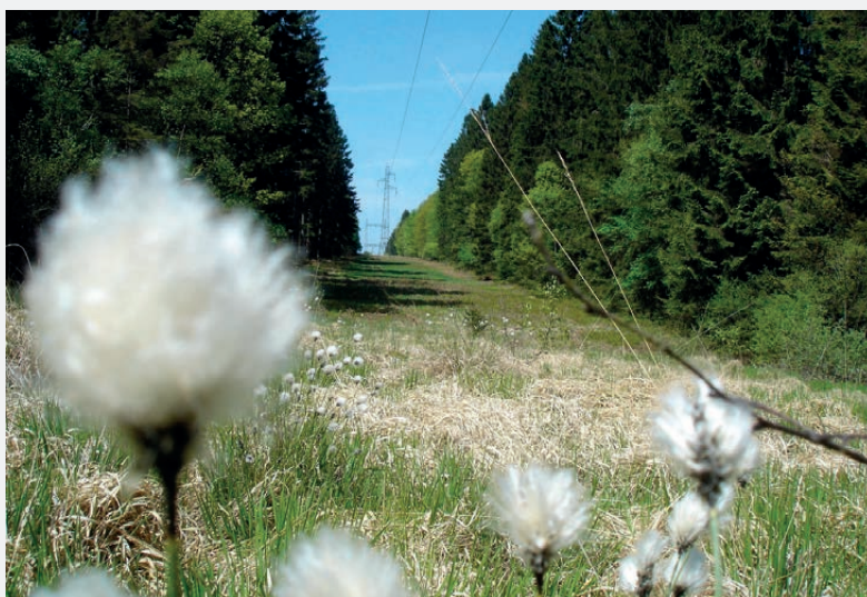
Alternative forest trench management in the Regional Natural Park of Ardennes

Most of the industrial sites operated by EDF – power plants, dams, wind farms, etc. – are located in or close to natural areas, and they have an impact on nearby fauna and flora.