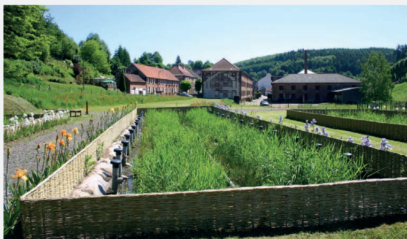
Vegetated filters – Saint-Louis' gardens

Ultimately, the "Cristallerie de Saint-Louis" aims at improving its filtering gardens efficiency by reusing the clean water produced into the site workshops, thus reducing even further its environmental footprint.