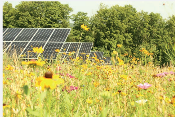
Solar parks with flower ©ENGIE Distributed solar, North America