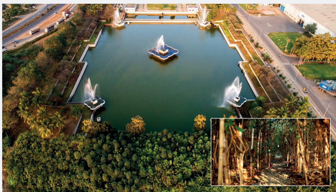
Views of the urban forest at Saint-Gobain's Chennai site

The urban forest, which does not encroach on the vital needs of the surrounding population, plays an important role in ecology in many ways: it attracts birds, creates a barrier against noise, slowing also wind and storm water, reduces the ground temperature and increases the water table.