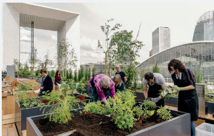
Collaborative gardens on the Head office's rooftop in La Défense

In addition to the "Jardins de Noé" label, some of RTE's tertiary sites have been granted "Refuge LPO" 50 and "BiodiverCity" 51 labels. RTE is also committed to develop green spaces of all its new sites or of sites undergoing major rehabilitation work.