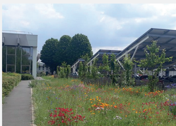
Orly-Rungis business park

The first way in which Icade protects nature is by building solely in city centres, on previously developed land where biodiversity is generally very poor to begin with.