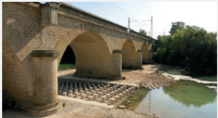
Rockfill fishway at the level of the raft of the Vidourle bridge in Gallargues le Montueux

- analysis of ecological continuities with the railway network (carried out in particular in Ile-de-France), with the aim of enhancing the potential of the Ile-de-France rail network while combating the ecological discontinuities caused by the tracks and their structures in the territories and habitats crossed, - restoration of aquatic continuities with the installation of fishways, in order to ensure sufficient transport of sediments and the circulation of migrating fish, in accordance with its water policy.