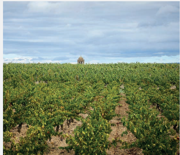
Organic vineyard in Languedoc

To ramp things up in scale, InVivo Wine and Château Maris have developed the "Maris" offer, based on the same environmental requirements as Château Maris. The offer is sourced from five cooperatives to organise the supply of sustainable wines in terms of volume and quality. In two years, they hope to go from 0 to 750,000 bottles of certified organic wine.