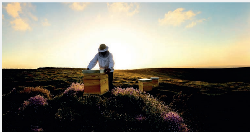
Quessant Island, biosphere reserve

In 2019, LVMH signed a five-year partnership with UNESCO's "Man and Biosphere" program, of which motto is "Living in harmony with nature". Under this program, the Group finances the deployment of projects with environmental, social and economic benefits for biosphere reserves (701 reserves located in 124 countries). These projects, validated by independent scientific experts, are specific and adapted to local situations but also replicable on a larger scale for the conservation and sustainable use of biodiversity.