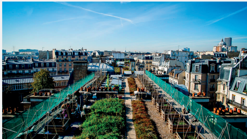
Experimental vegetable roof at AgroParisTech using urban residues as technosol components

https://www.lab-recherche-environnement.org/fr/ http://www.patrinat.fr/fr/eurovia-6209