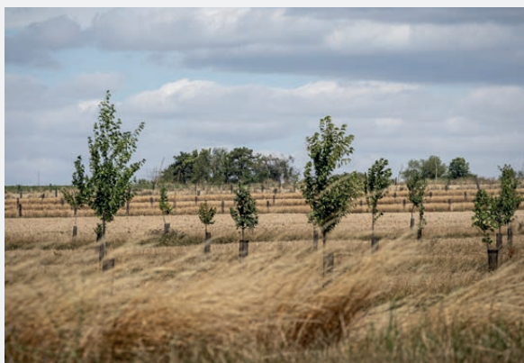
Agroforestry plantations with a partner farmer

To be confirmed with further follow-ups!