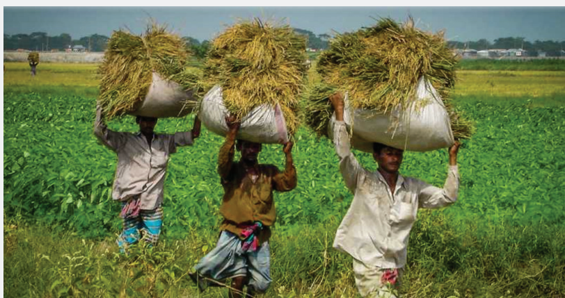
Natural capital: first investment of the LDN Fund in Peru

After financing its first project in Peru — to provide agroforestry systems for small coffee producers — three new land restoration projects have been proposed by Natixis and its partners: in Bhutan, Indonesia and Kenya, involving 30,000 small farmers, with the aim of restoring over 45,000 hectares of degraded land and capturing nearly 2 million tons of CO 2 .